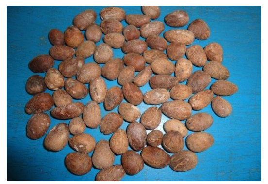
Plate 2: Shea kernels